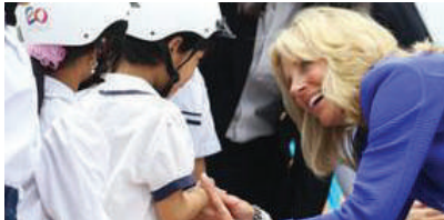
Dr. Jill Biden, wife of U.S. President Joe Biden, gave helmets (co-sponsored by NDTC Foundation together with US Embassy and AIP) to children in July 2015.

Charitable activities were initiated by NDTC from the very first days of the company establishment with the core activity is to provide adequate assistance to poor and disabled children in mountainous and remote areas of Vietnam. Multiple activities including providing warm clothes and studying materials as well as building classrooms, schools and libraries for poor and disabled children in mountainous and remote areas of Vietnam.